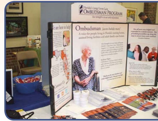
Display at Tallahassee Senior Center

The 16th annual Active Living Expo was held Thursday and Friday, September 11-12, at the Tallahassee Senior Center. Seventy-one exhibitors provided health screenings and information on community resources to hundreds of attendees. The expo commenced on Thursday evening with a reception, vendors, games, and it culminated Friday with an even bigger celebration. The atmosphere in the ballroom was festive, joyful, and filled with bursts of laughter and the aroma of fresh popcorn. All exhibitors offered a plethora of information and free goodies.